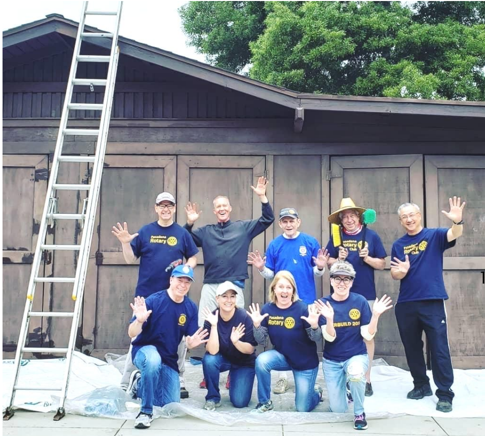
DIAD - Ronald McDonald House

Hello Pasadena Rotary! How did you enjoy our break-out groups? It's my goal to keep you connected and engaged with different members of our club each week. We will be doing this on a regular basis.